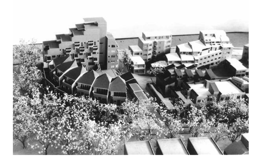
Project Three. Upper middensity housing with a density range of 38 to 72 du/ac (94 to 178 du/ha): (Top) Overview from the southwest showing tree-lined, central street; (Bottom) A detail view from the northwest showing typical existing housing in near foreground.

than was seen in the first. Windows tend to be more of a single size and shape. Terraces and gardens are smaller and less visible. This is not the result of less desire on the designer's part for creative self-expression, but is almost entirely the result of lowered S:V that lessens possibilities for identifying separate dwelling units.